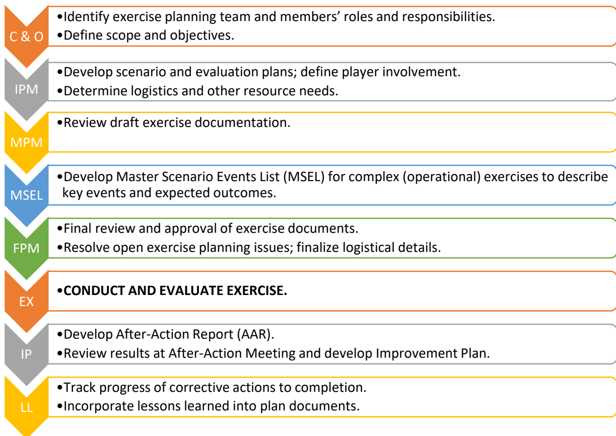
Figure 2. HSEEP order of exercise planning meetings and primary objectives for each (adapted from HSEEP Policy and Guidance 2020 )