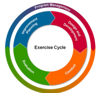
Figure 1: HSEEP Cycle